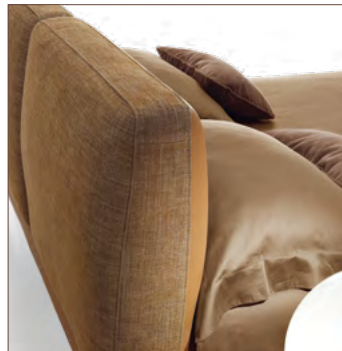
Testata con 2 texture, basta girare la testata ed avere un altro look: sistema reversibile.

Headboard with 2 textures; just turn the headboard around to achieve a different look: reversible system.