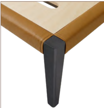
Facce Imbottite sfoderabili

Powdre-paint base finish: White Ral 9003, Sablé, Ardesia, Manganese, Bronze, Anodic Bronze, Safari Bronze, Amber Gold.