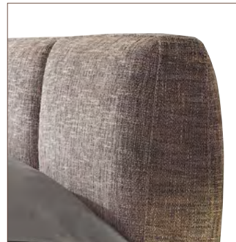
Testata con 1 texture, basta girare la testata ed avere lo stesso comfort: sistema reversibile.

Headboard with 2 textures; just turn the headboard around to achieve a different look: reversible system.